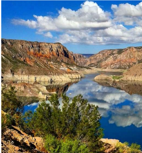
Whitewater Rafting Mendoza