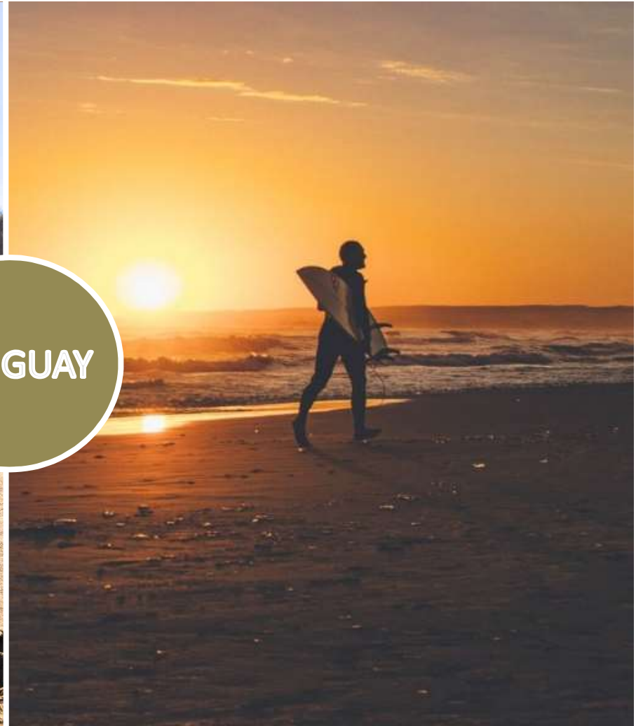
Surfing (with sea lions) at Cabo Polonio