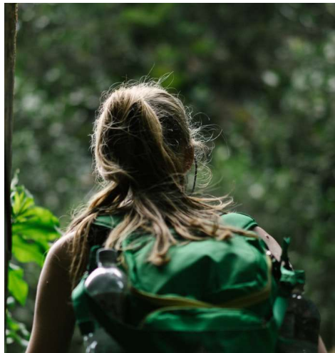
Hiking at the Cocora Valley