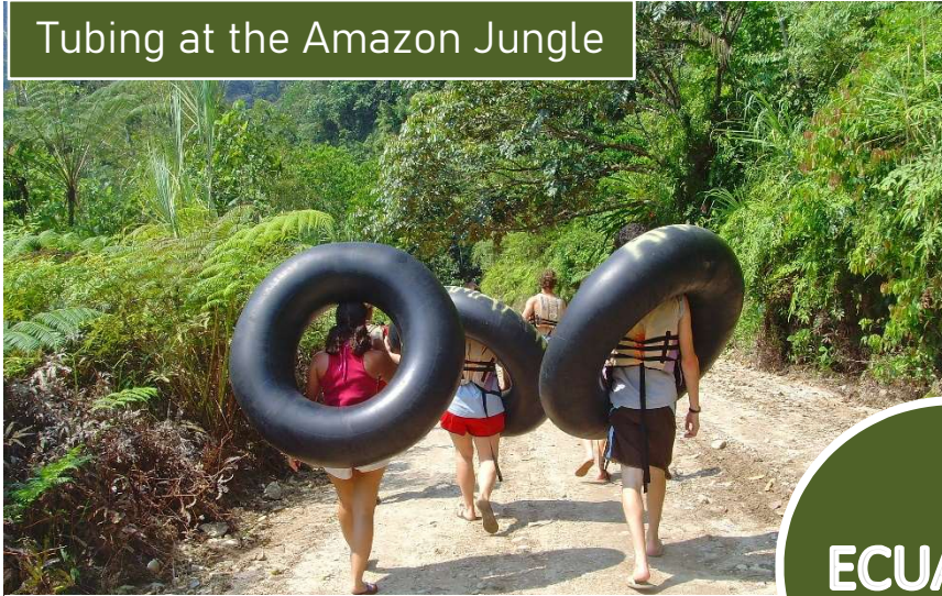
Tubing at the Amazon Jungle