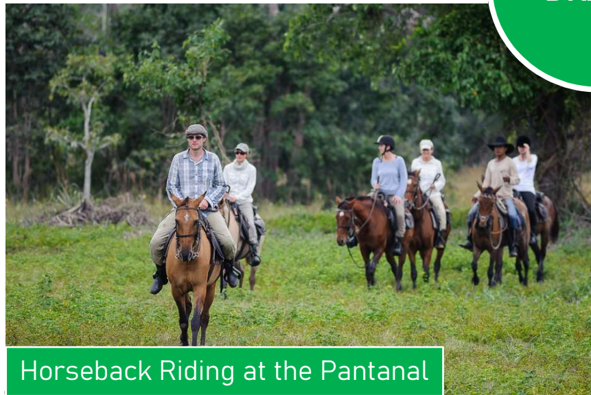
Horseback Riding at the Pantanal