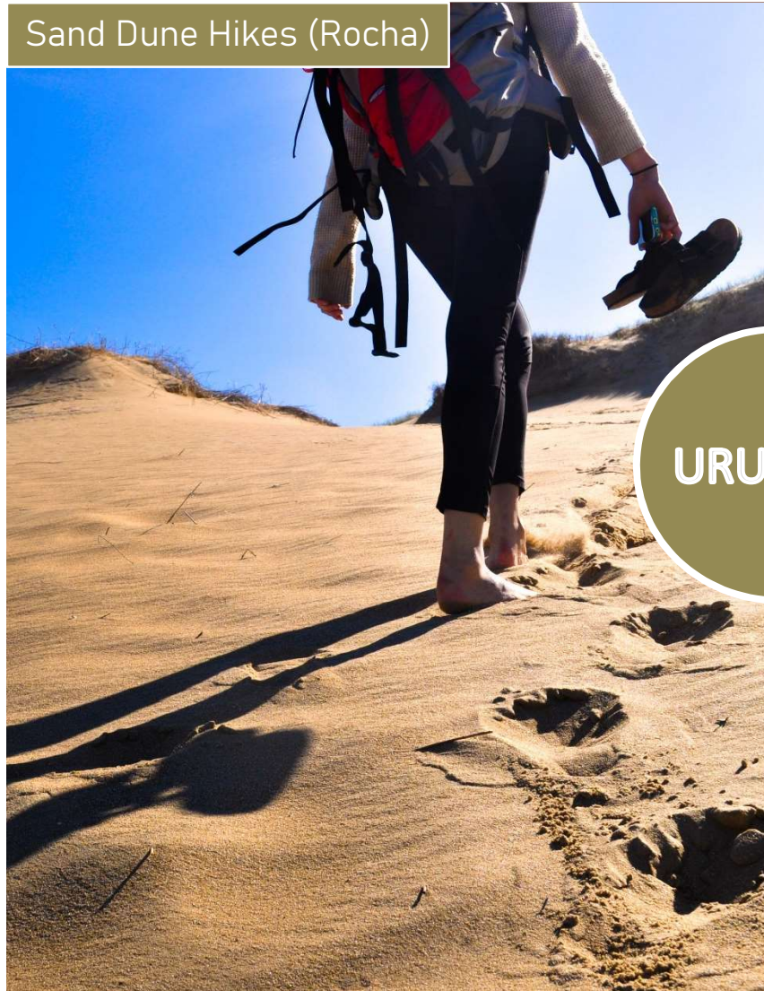
Sand Dune Hikes (Rocha)