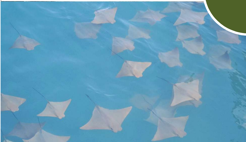
Diving with Manta Rays (Galapagos Islands)