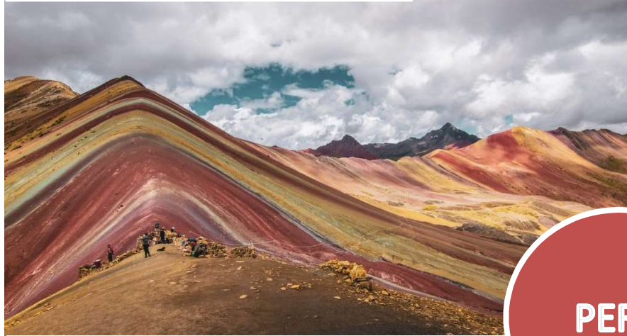
Trekking Rainbow Mountain