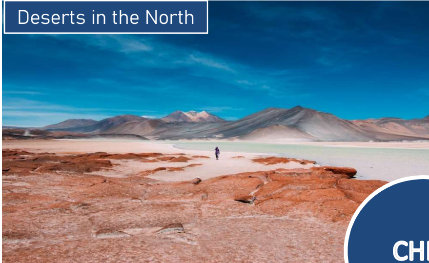
Deserts in the North