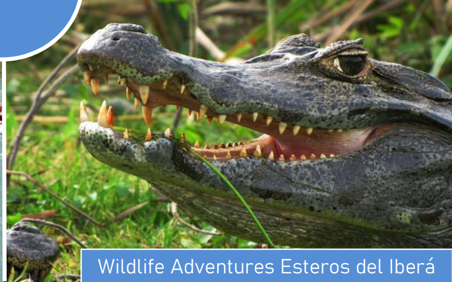
Wildlife Adventures Esteros del Iberá