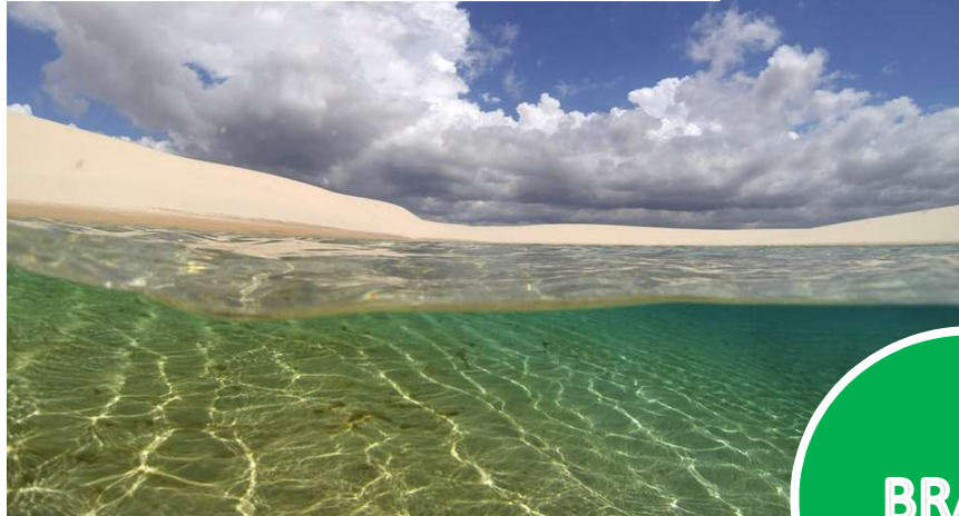
Road Trip: The Route of Emotions