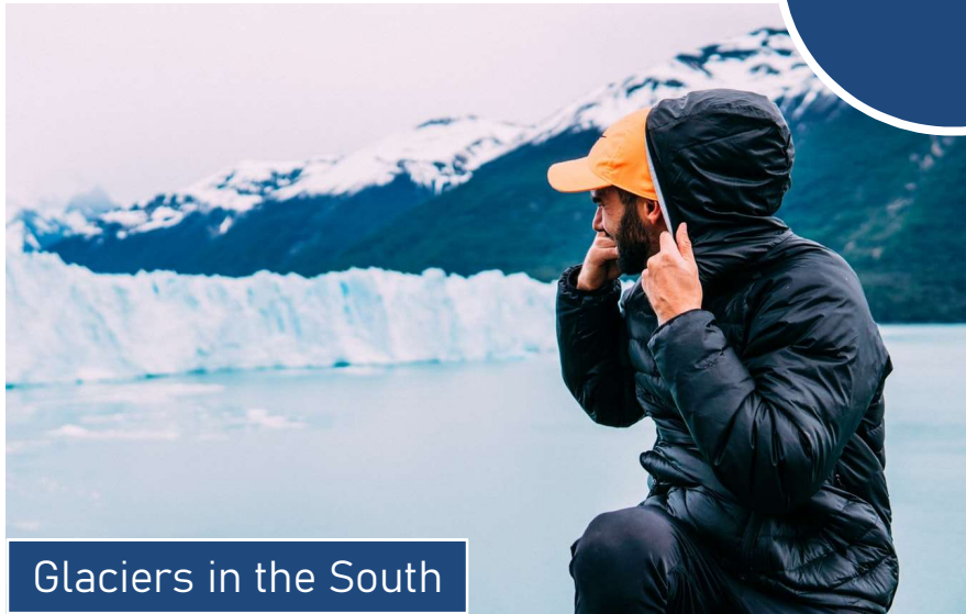
Glaciers in the South