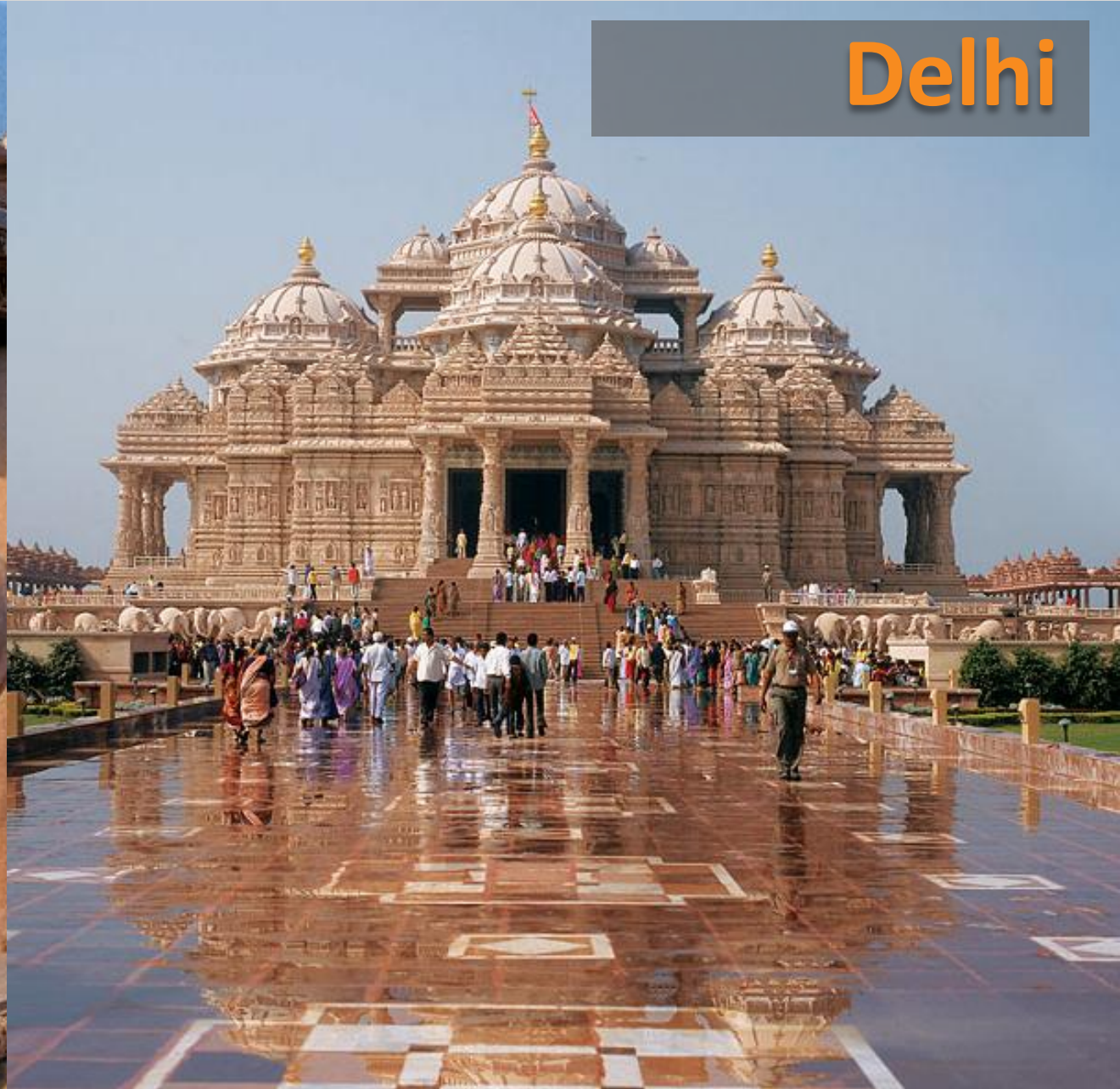
Kompleks świątynny Akshardham