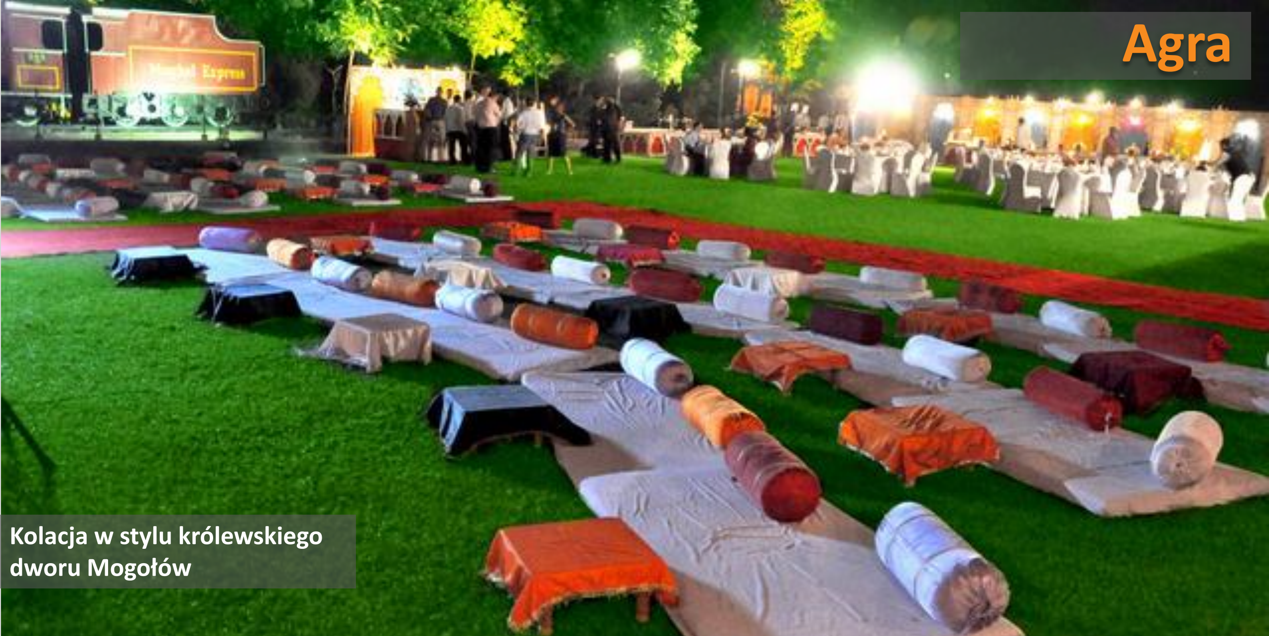
Kolacja w stylu królewskiego dworu Mogołów