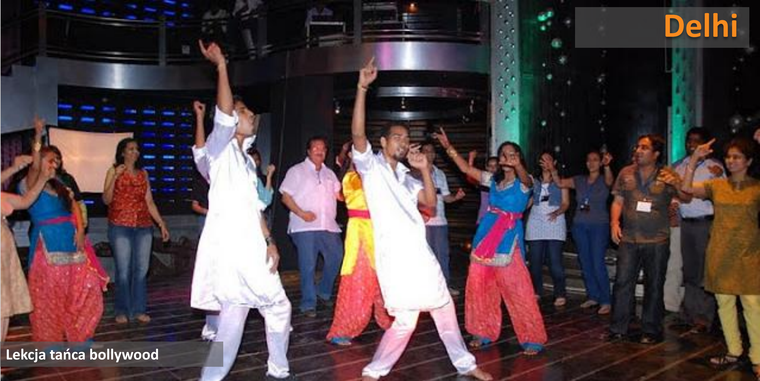
Lekcja tańca bollywood