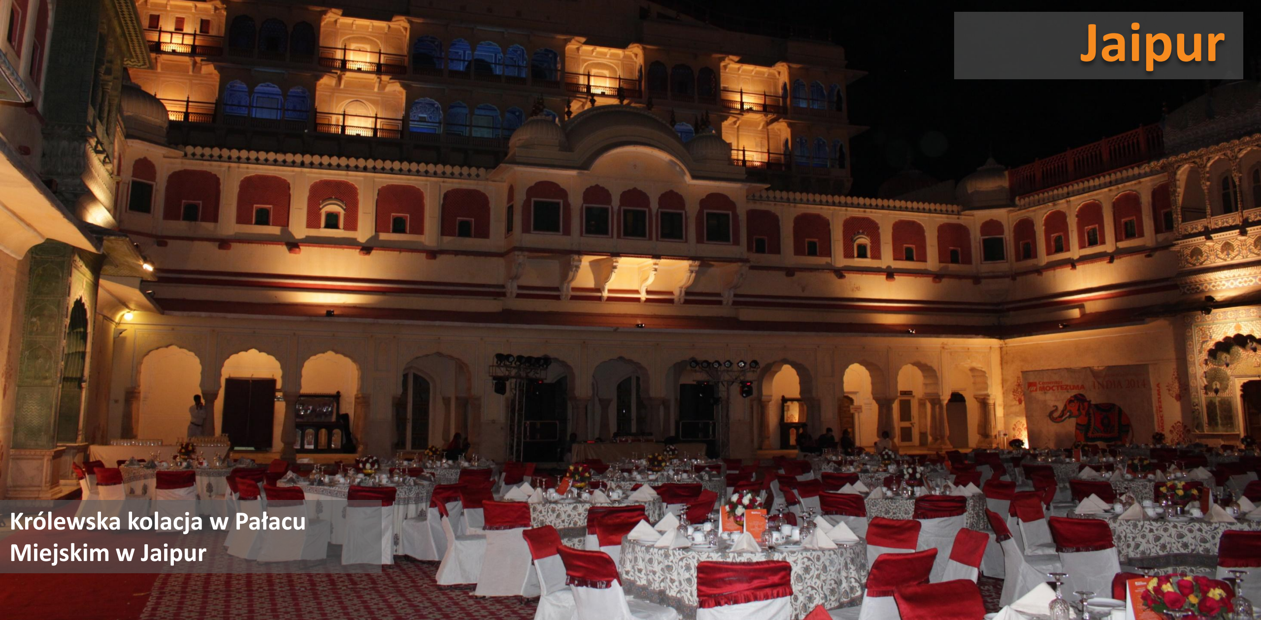
Królewska kolacja w Pałacu Miejskim w Jaipur