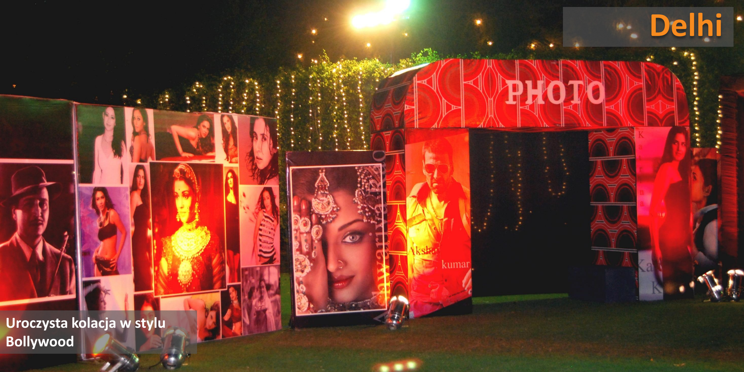
Uroczysta kolacja w stylu Bollywood