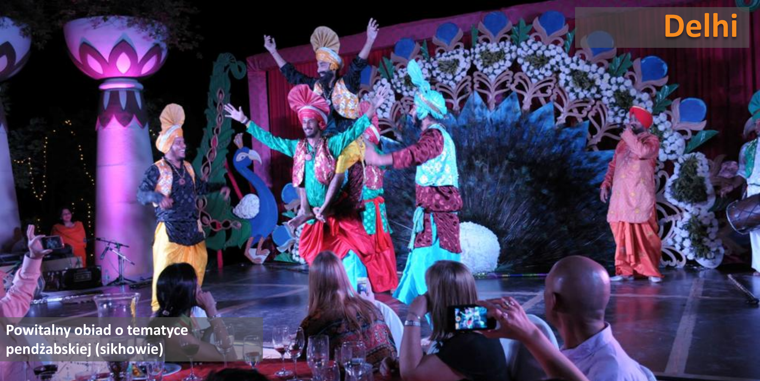
Powitalny obiad o tematyce pendzabskiej (sikhowie)