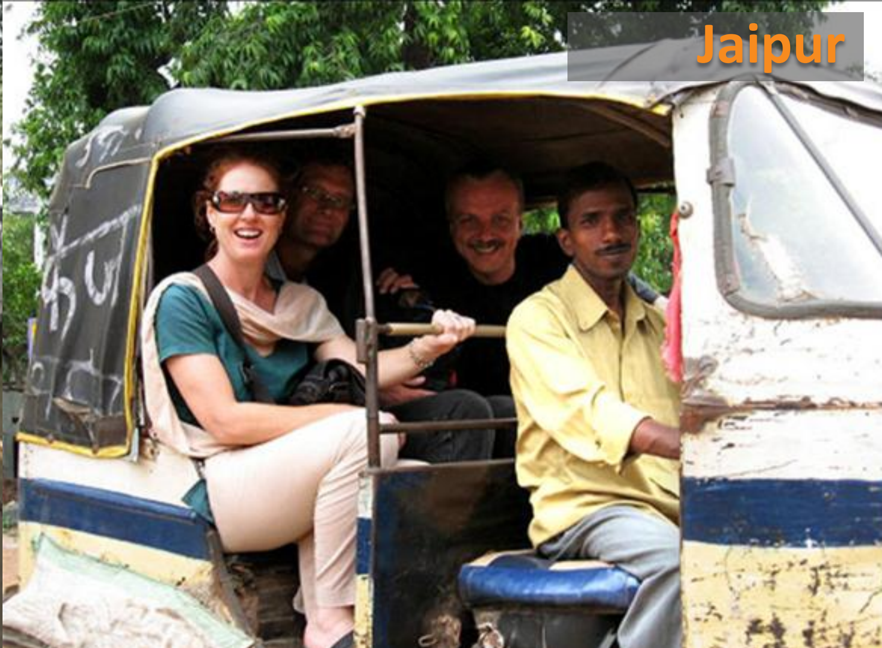
Podróżowanie tuk-tukiem po Jaipurze