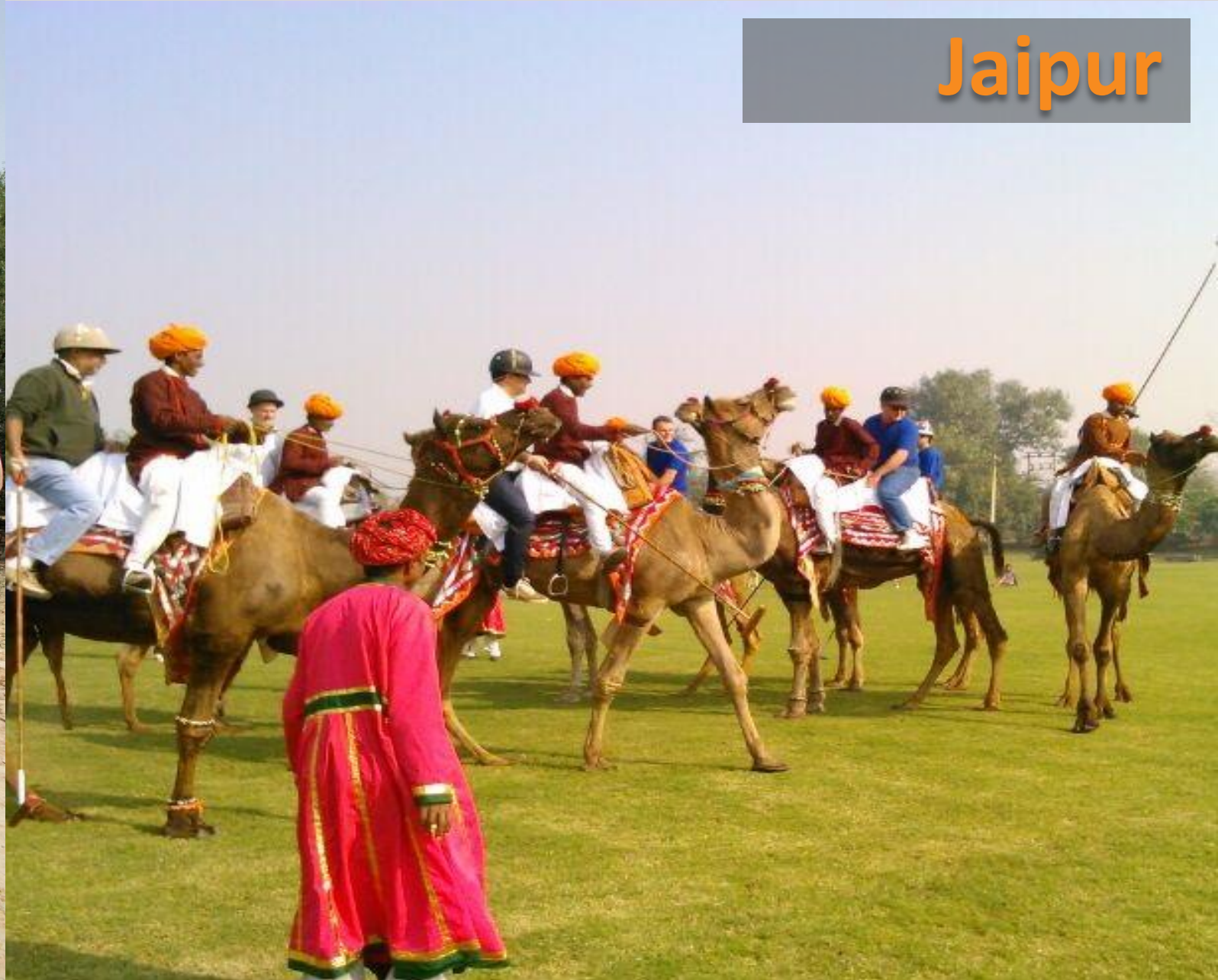
Przejażdżka na słoniach / Polo na wielbłądach w Dera Amer