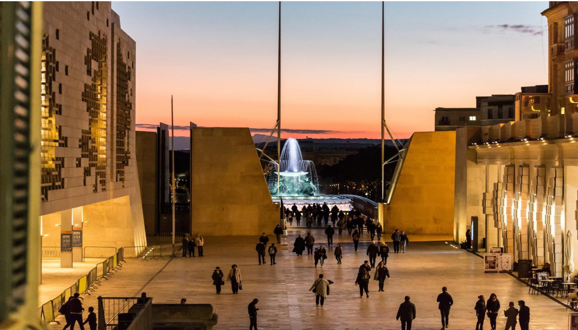
Triton fountain... parliament building by Renzo Piano ...V18