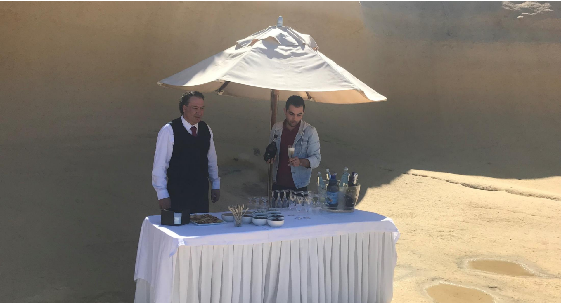
Maltese food ...surprise table ...aperitivo ...gozo salt pans